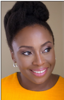
Chimamanda Ngozi Adichie